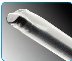
D-Shaped Endoscope with disposable sheath